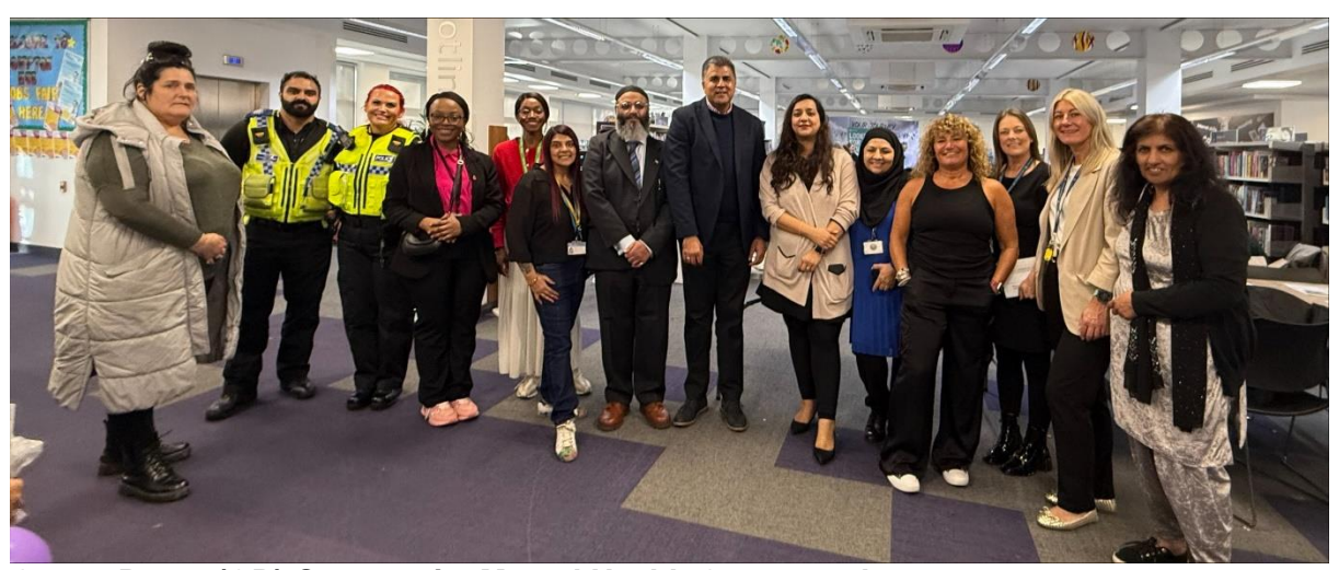
Gypsy Roma (GR) Community Mental Health Grants update

The grants were awarded earlier on in the year to tackle the mental health, communication, and barriers that the GR community face. One of the grants awarded was for a drop-in triage service at Bellbrook Surgery, this service is for the GR community to attend the surgery to gain support with translation and with questions about primary care services to enable access for appointments. This is proving an invaluable service to the community with people attending each week.